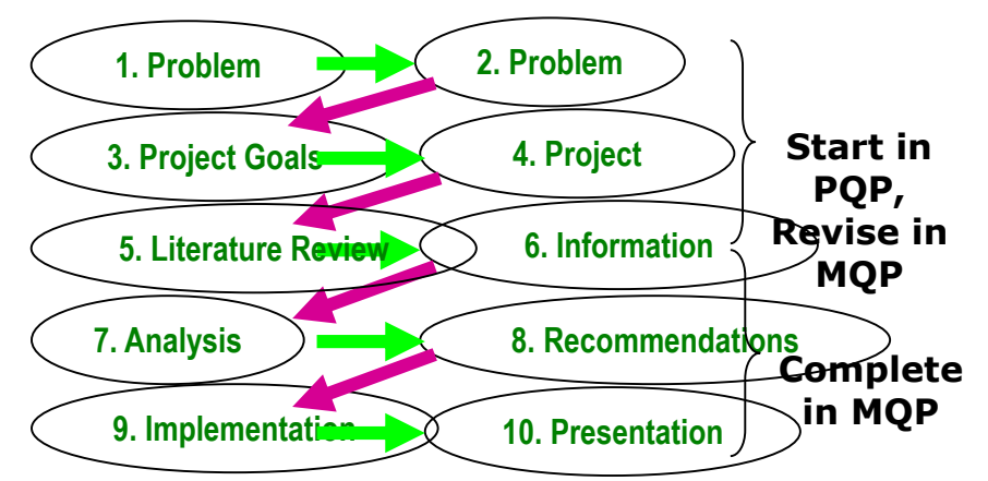
Figure 2. Project cycle with preparation and completion of projects in China Center

partners from HUST visit the companies to gain the first hand understanding of the company operations and the problem to be solved, while confirming and modifying their project plan. Then they come to HUST campus to conduct the project activities, while traveling back to the company sites to collect data, report and test project progress, and for other necessary face-to-face communications, according to the project requirements. The students own the projects and drive the project progress based on the project plan. They are required to have formal weekly meetings to report the project progress, with presentation and discussion minutes distributed to co-advisors and industrial mentors. The students often need to deal with communication obstacles and project scope changes, practicing the real world problems. In the final presentation, all student teams get together to show their project results to the audience invited from companies (sponsoring or not sponsoring projects) and universities (involving or not involving in the projects). Figure 2 shows the project cycle.