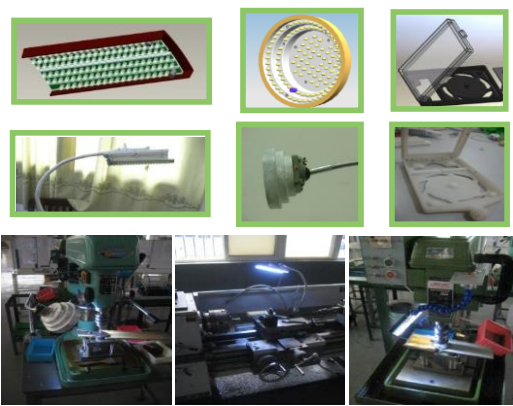
Figure 3. LED lighting system designed and prototyped by the students in 2009